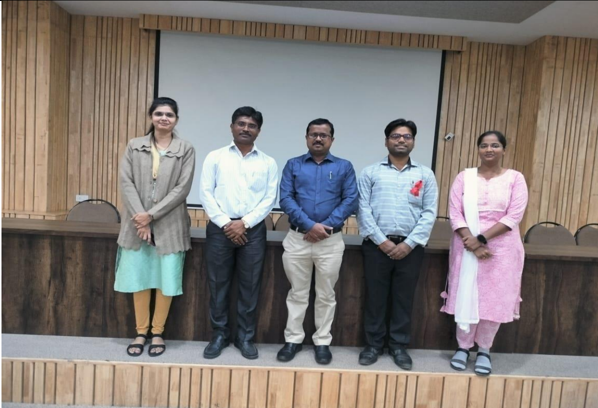
Faculty of Department of community Health Nursing