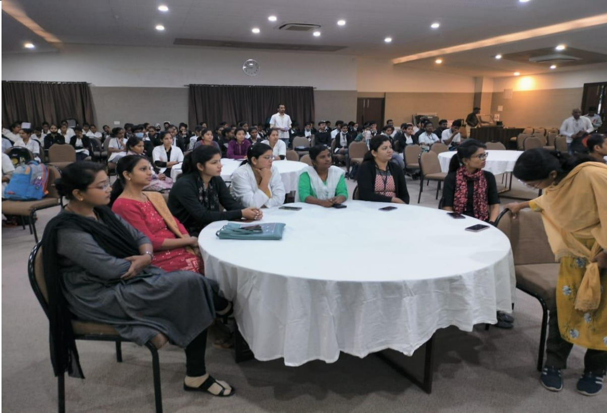
Faculty & students attending the Workshop.