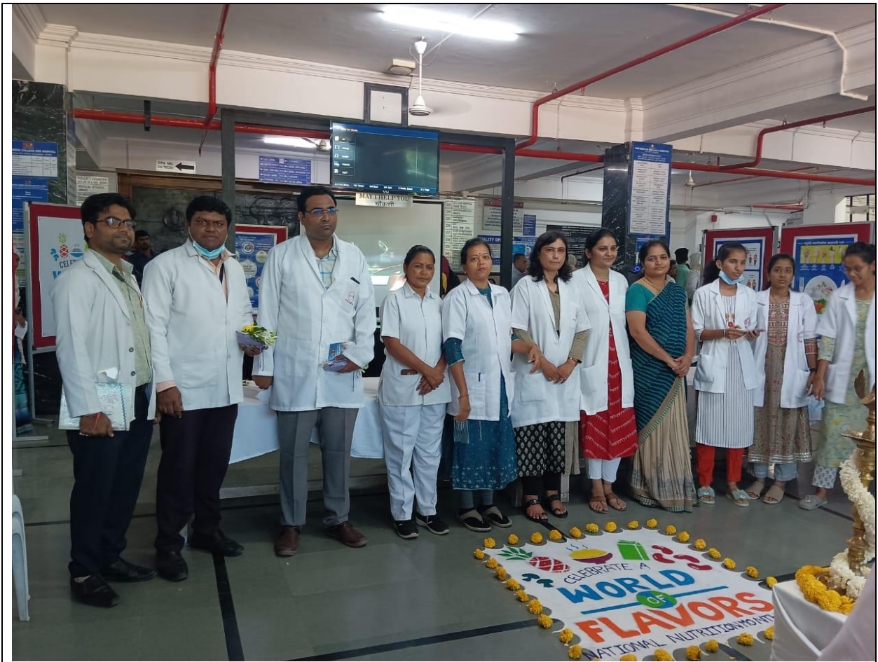
On the occasion of National Nutritional week our college organized Nutritional week celebration along with MGM hospital with the theme "world of Flavors" by M.Sc students at 01/09/2022