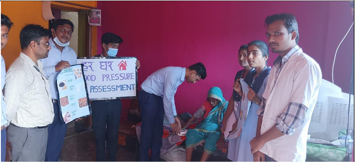
Har Ghar BP Assessment camp was organized by the BSc nursing II yr and MSc II yr students at Aland Tq Phulambri.