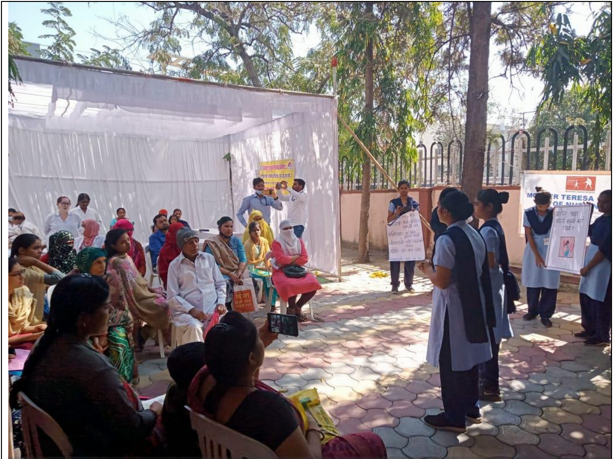
Health Assessment camp Health Education by IV BSc Nursing at N-8 Health center Aurangabad.