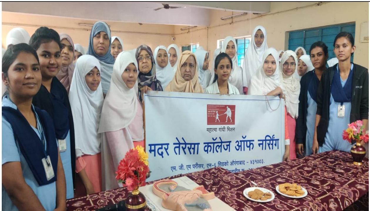
Health Assessment and Education on Menstrual hygiene by IV BSc students at Fathima Urdu School ,Kaisar Colony Aurangabad.