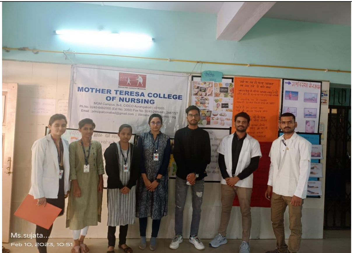
Sakhi Centre Visit [One Step Crisis ] at Health Center Neharu Nagar Aurangabad. On 08/02/2023