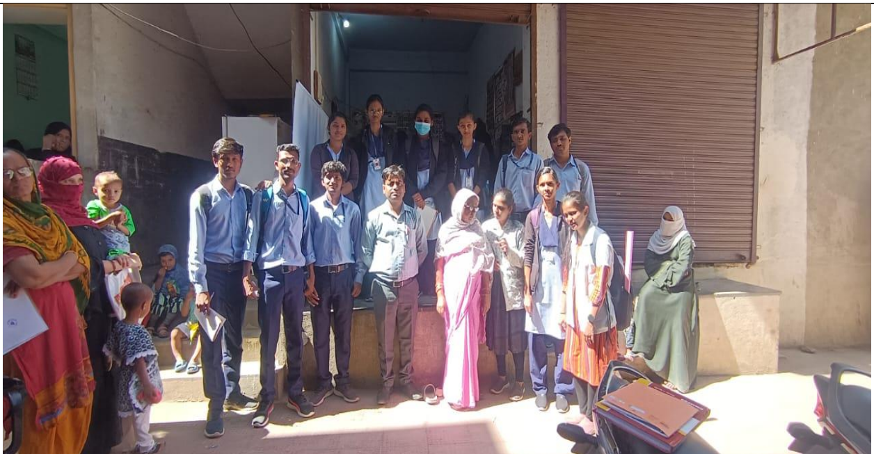
Anganwadi Visit by IV BSc Students