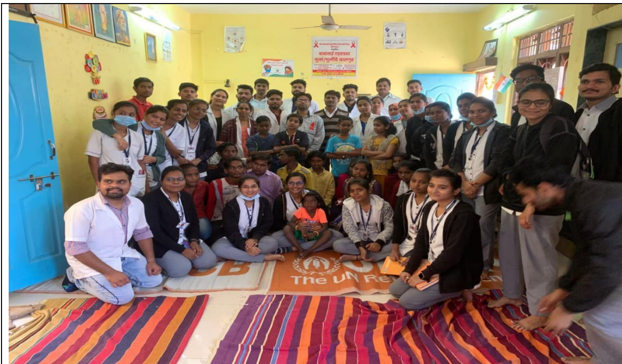
Recreational activities AIDS affected children by MSc II year students and IV BSc Nursing Students.