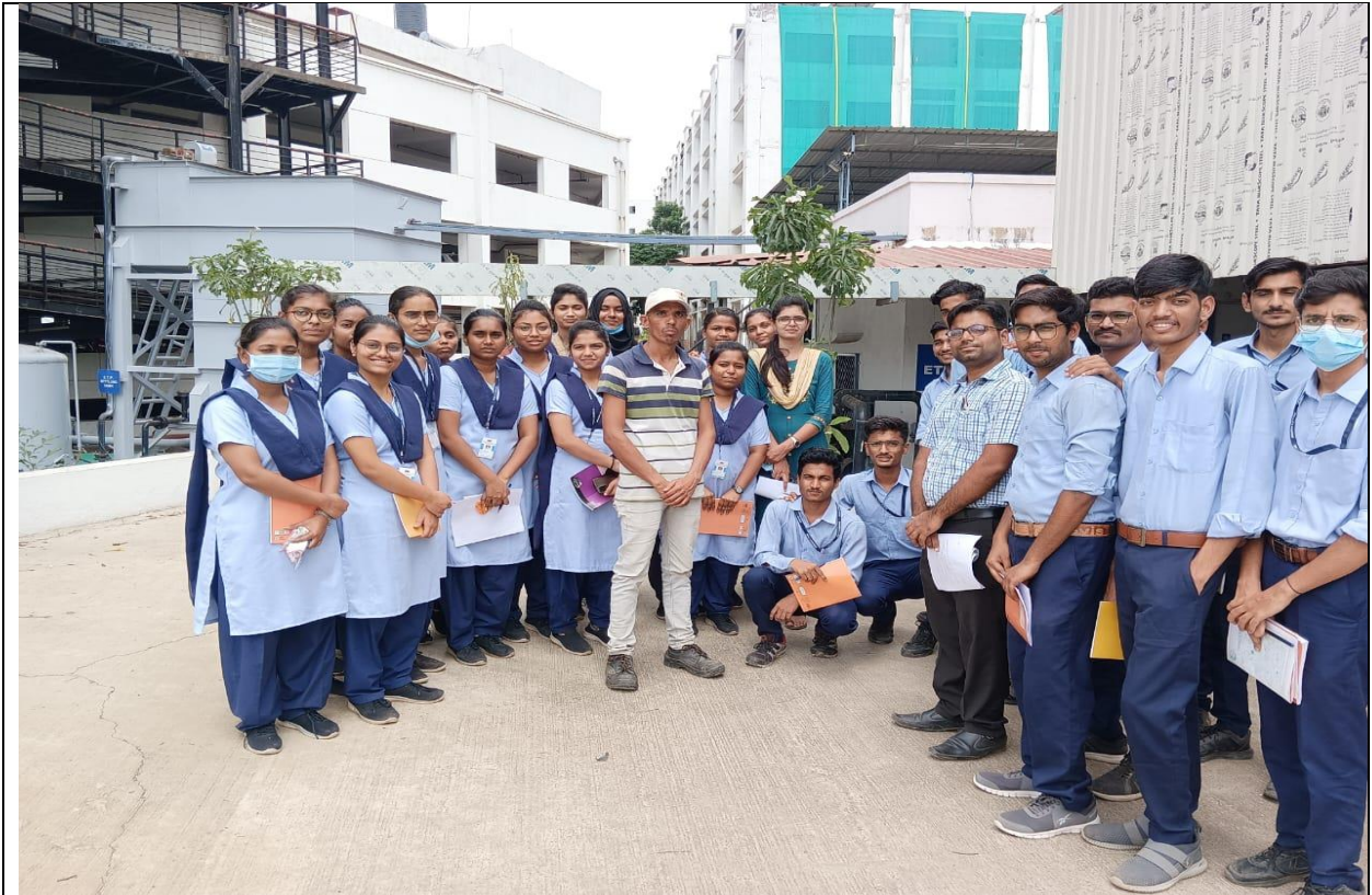
ETP / STP Plant Visit by II year BSc students at MGM campus on 03/08/2023.