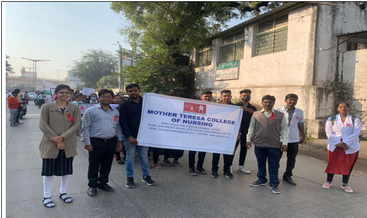
Rally On World HIV / AIDS on 01/12 / 2023