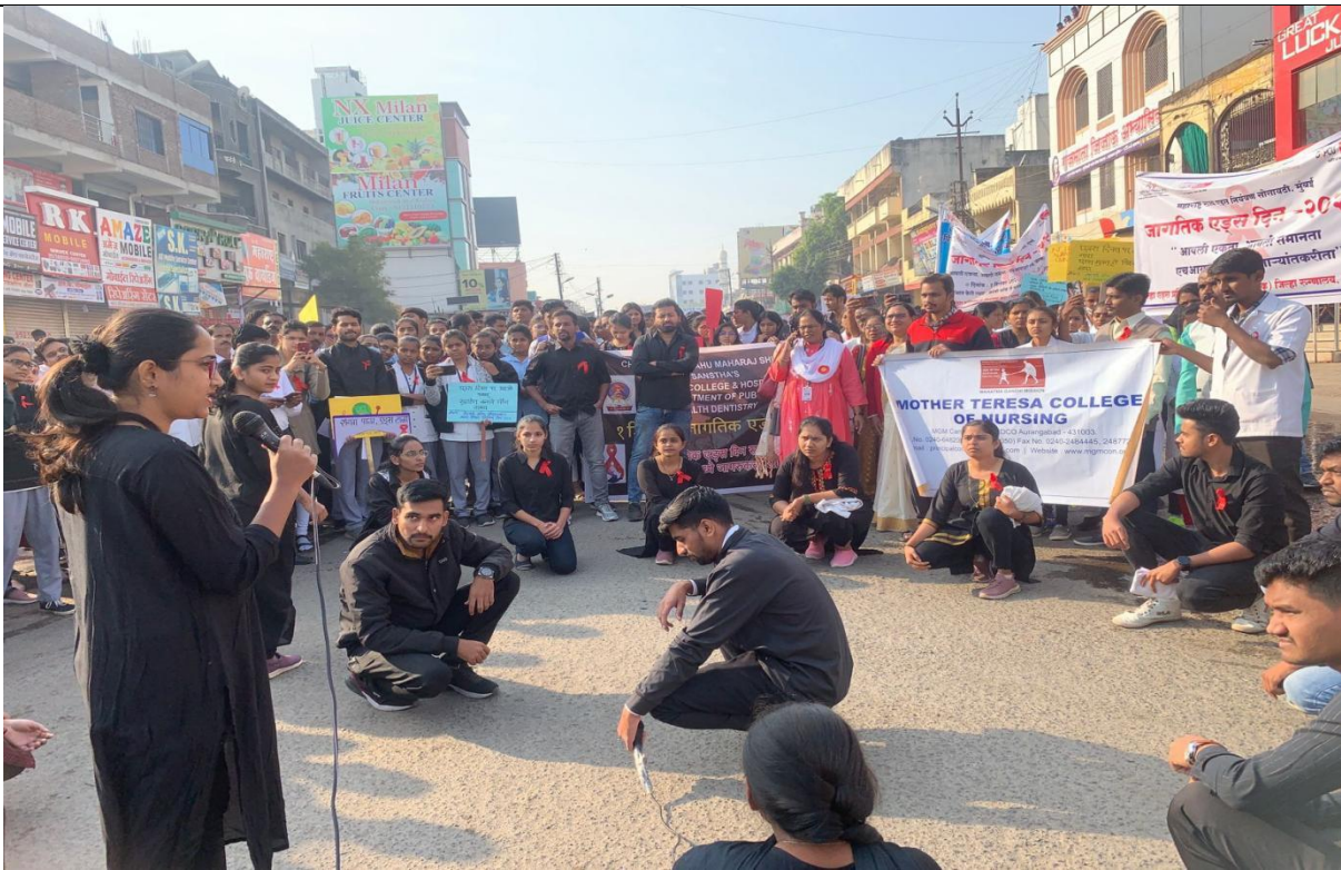
First MSc Performed Skit on social Stigma Regarding HIV/AIDS at Paithan Gate on 01/12/2023